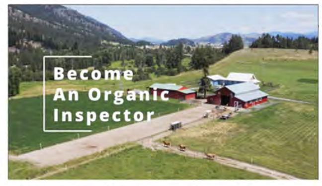
Click the image to view the Organic Inspector video on YouTube.

This video was developed by the organic community, led by Oregon Tilth and International Organic Inspectors Association, under the NOP Human Capital Initiative.